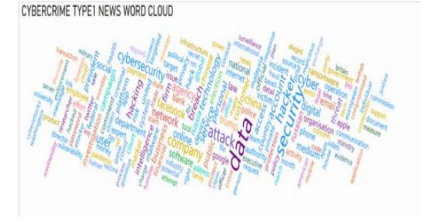
Figure 1. Example of a figure caption. (figure caption)

as shown in Fig.1. These words are commonly linked to Type 1 cybercrime news. Additionally, words such as China and Facebook indicate local Type 1 cybercrime news related to these entities.