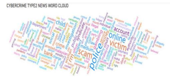
Figure 2. Example of a figure caption. (figure caption)

Continuing to analyze the word cloud, we can see that the frequency of words such as data, company, attack, hacker, and security indicates the common themes and topics discussed in Type 1 cybercrime news. The presence of words like China and Facebook suggests that there may be specific incidents or events involving these entities that are of interest in the cybercrime landscape. By examining these patterns and trends, we can better understand the current state of cyber threats and potentially identify areas for further research and investigation. This insight can be valuable in developing strategies to prevent and mitigate cyberattacks in the future. In cybercrime type 2 news, the presence of words like police, victim, and scam indicates their association with this type of cybercrime, concerning Fig. 2. The Word Cloud also shows the words' bank account, Malaysia, 'datuk', and woman are frequently mentioned in cybercrime type 2 news. The Word Cloud raised questions and prompted a deeper analysis of the frequent mention of specific words in both cybercrime type 1 and type 2 news.