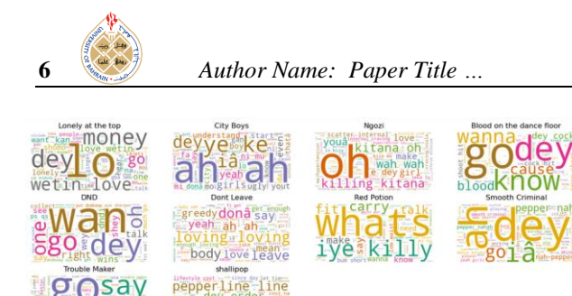
Figure 5. Word Could of each lyrics

The largest and most prominently displayed words in the word clouds are likely to represent central themes presented in the lyrics. It is important to acknowledge that the frequency of words reflects their usage and expression rather than just their semantic meaning as shown in fig. 5.