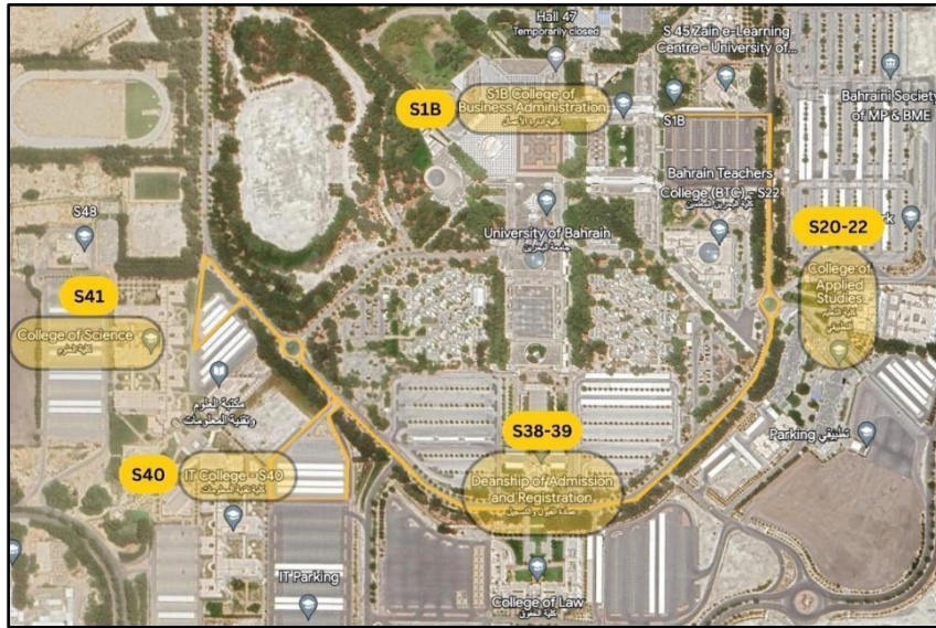
Figure 1. Aerial View of UoB Sakhir Campus.

buildings, necessitating seamless internal mobility. This is particularly crucial due to the campus's considerable size, the intense heat prevalent during the academic year, and the limited time between lectures, making the use of walking pathways impractical. To address this issue, the university has implemented a bus transportation system to facilitate student movement around the campus.