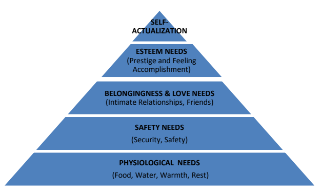
Figure: 1 (Maslow, 1943 in McLeod, 2018).

The theoretical framework of the study was hinged on the theory of Maslow's hierarchy of needs. Maslow (1943) in McLeod (2018), posited that the theory is a motivational theory that has five-steps model of human needs in hierarchical levels arranged within a pyramid. The needs at the lower levels in the pyramid must be satisfied first before individuals can think and move to attend to next needs at higher up in the hierarchy. From the bottom of the hierarchy upwards, the needs are: physiological, safety, belongingness & love, esteem and self-actualization as can be seen in figure 1.