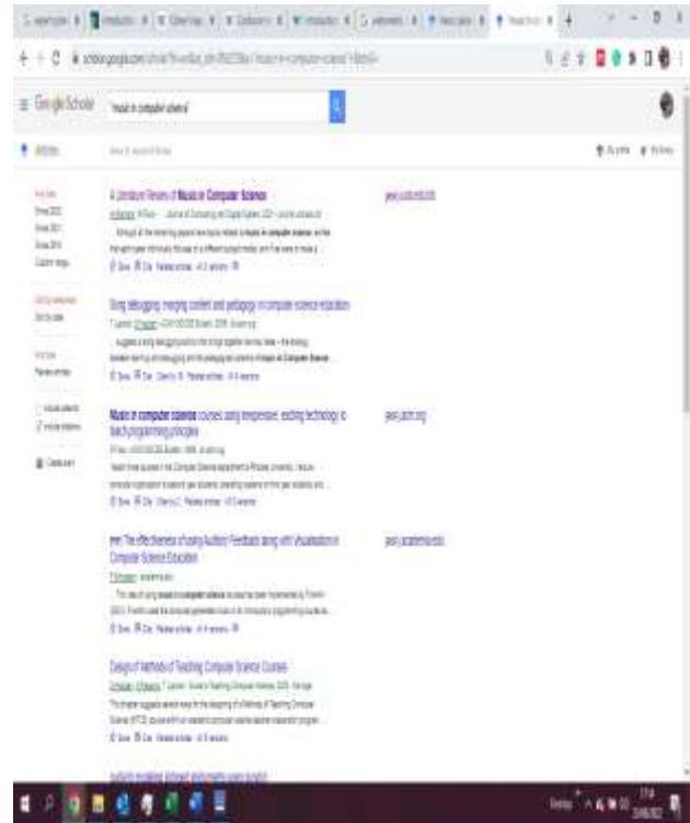
Figure 2. Searching results on google scholar

access them. In this case, we find and limit the total to 120 papers. Next, the search terms used are digital music, music technology, music education technology, computer music, music generation, and music composition technology.